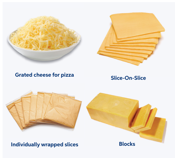
Grated cheese for pizza

CheddMax LB is specially formulated for use in a variety of processed cheese applications where reducing browning is required such as: