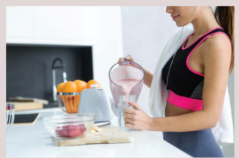
RTM powdered nutritional products