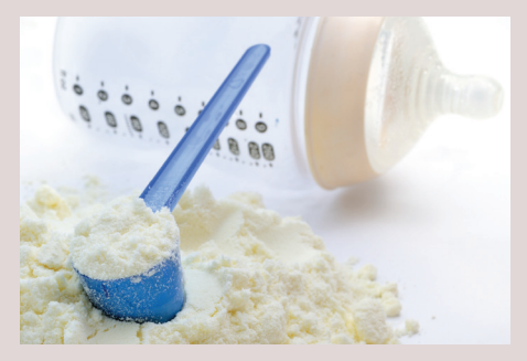
Child nutrition, such as follow-on formula and growing up milk