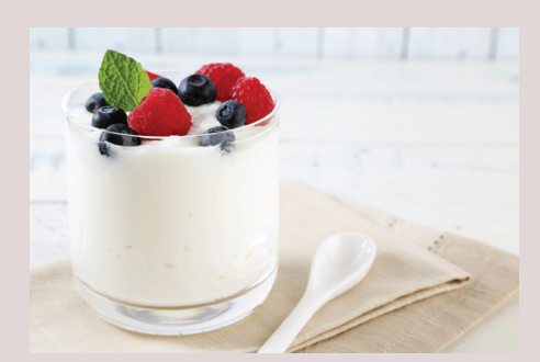
Protein fortified foods