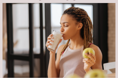
RTD beverages including meal replacement