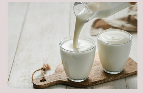
Medical & clinical nutrition applications